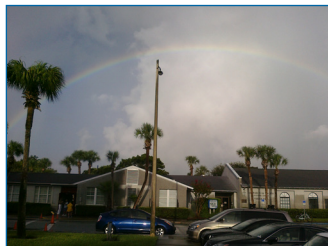
A rainbow was photographed behind Stormes Hall during the first week of school, thanks to one of our school parents.

Head of School letter continued on page 2